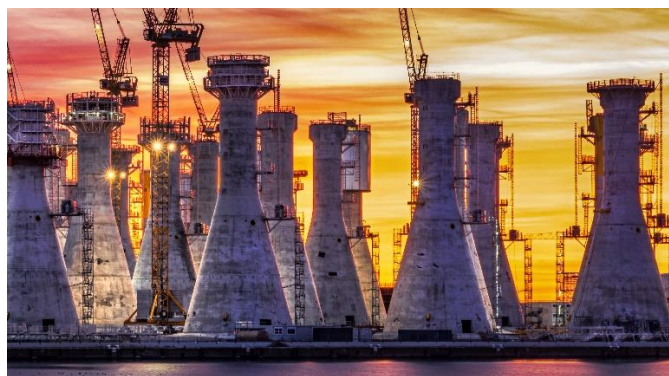
56 installed GEDA 500 Z/ZP